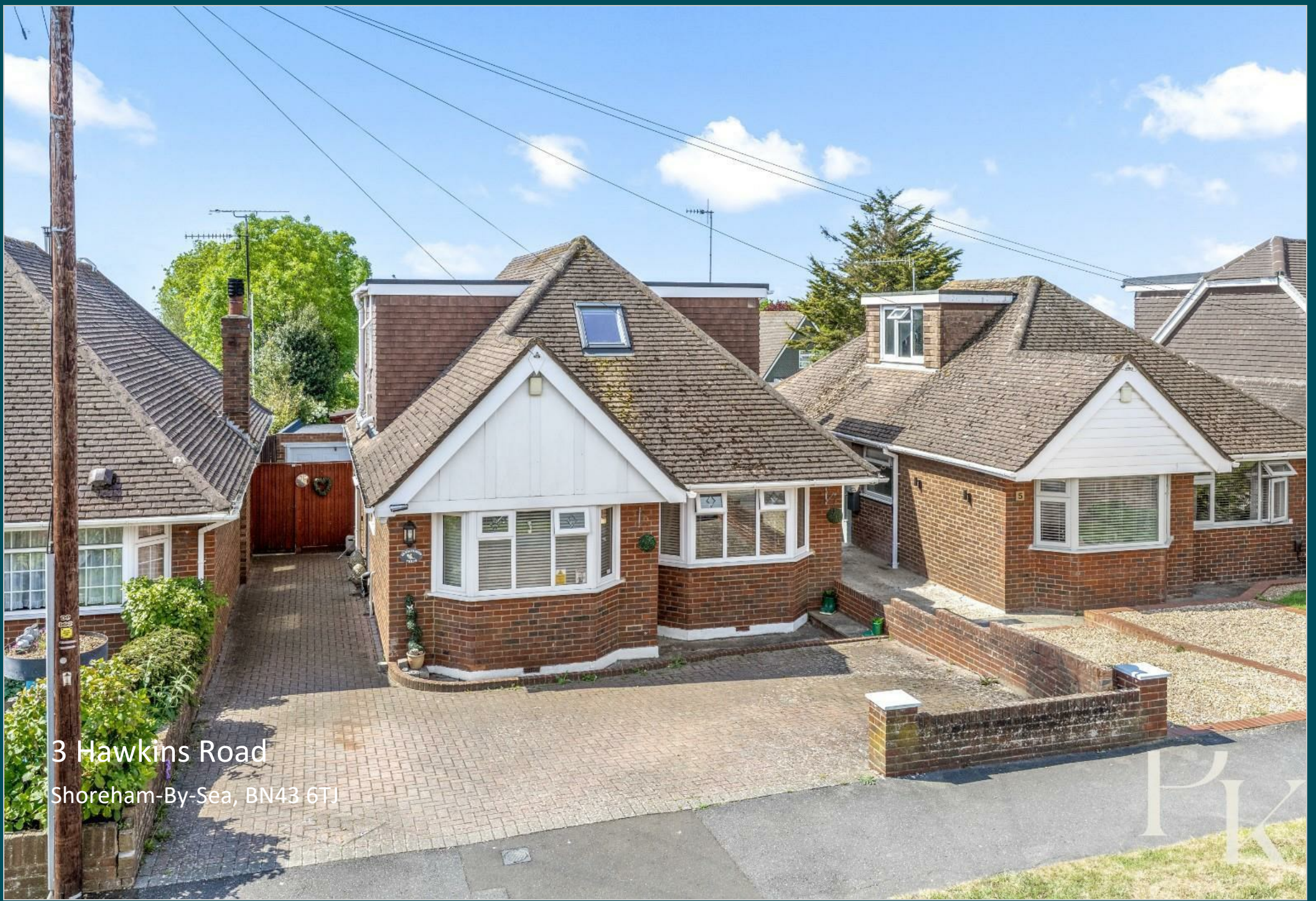
3 Hawkins Road Shoreham-By-Sea, BN43 6TJ